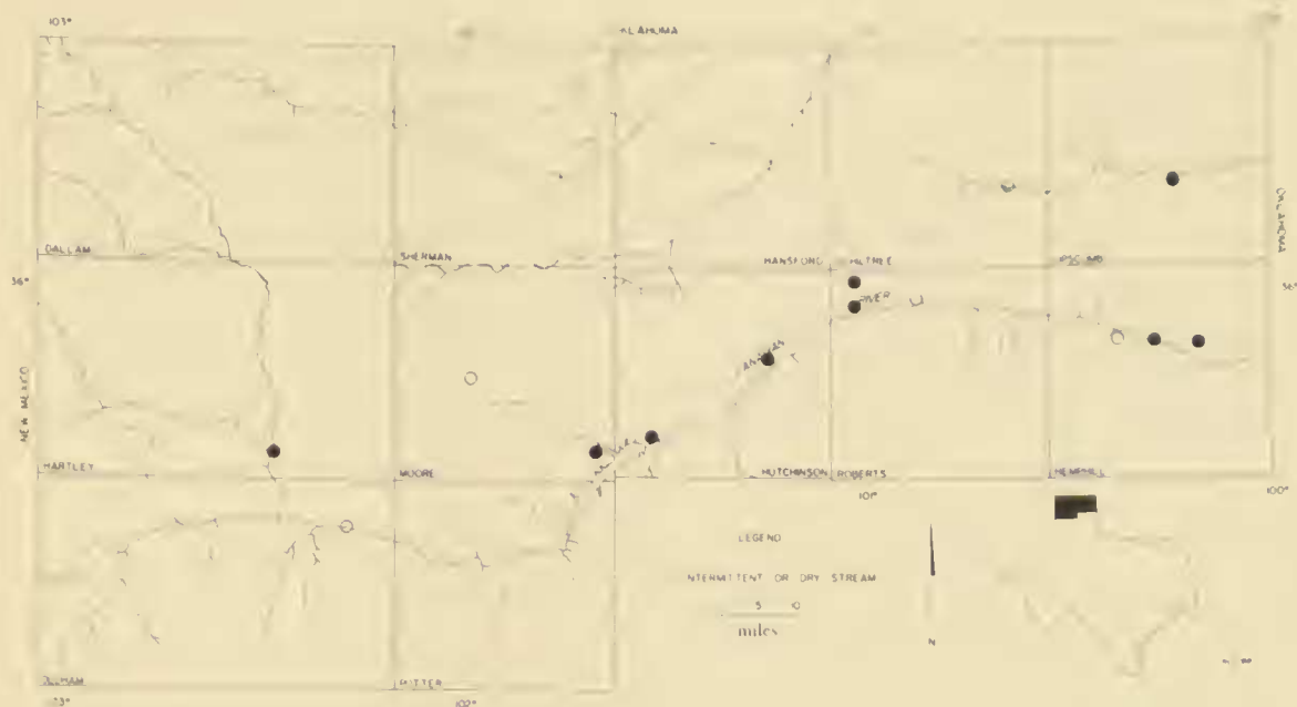
FIG. 14.—Distribution of Scalopus aquaticus in northern Texas Panhandle. Solid symbols represent specimens, open symbols represent localities where mole activity has been observed.

Blair (1954) reported moles as common on the sandy floodplain and on stabilized dunes along Bugby Creek in Hutchinson County. At Tascosa in 1899, Bailey (1905:207) “found mole ridges common over the sandy river bottoms.” We took one individual, and saw evidence of others, in the sandy valley of Rita Blanca Creek in Hartley County, a locality only some 35 miles east of the Texas-New Mexico border. In the late winter and spring of 1988, we trapped this species in sand-sage habitat in the Pats Draw area of northwestern Roberts County. The draw was a mile or more wide at the several places we collected and the whole area was literally honeycombed with mole tunnels; a dry creekbed (Pats Creek), lined with a few cottonwoods, some dead, ran southwardly the length of the draw into the Canadian. None of us had ever seen eastern moles so concentrated under natural conditions as in Pats Draw, where Geomys also was found, and where the soil gave way under almost every step because of the burrowing activity of these species. The same situation may prevail in some other of the sandy draws draining to the river.